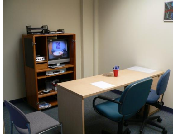
MDT "Watching Room"